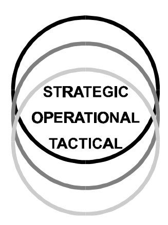
Figure 2. The Levels of War Compressed.

All actions in war, regardless of the level, are based upon either taking the initiative or reacting in response to the opponent. By taking the initiative, we dictate the terms of the conflict and force the enemy to meet us on our terms. The initiative allows us to pursue some positive aim even if only to preempt an enemy initiative. It is through the initiative that we seek to impose our will on the enemy. The initiative is clearly the preferred form of action because only through the initiative can we ultimately impose our will on the enemy. At least one party to a conflict must take the initiative for without the desire to impose upon the other, there would be no conflict. The second party to a conflict must respond for without the desire to resist, there again would be no conflict.